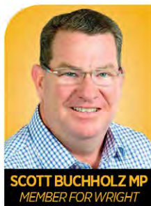
SCOTT BUCHHOLZ MP MEMBER FOR WRIGHT